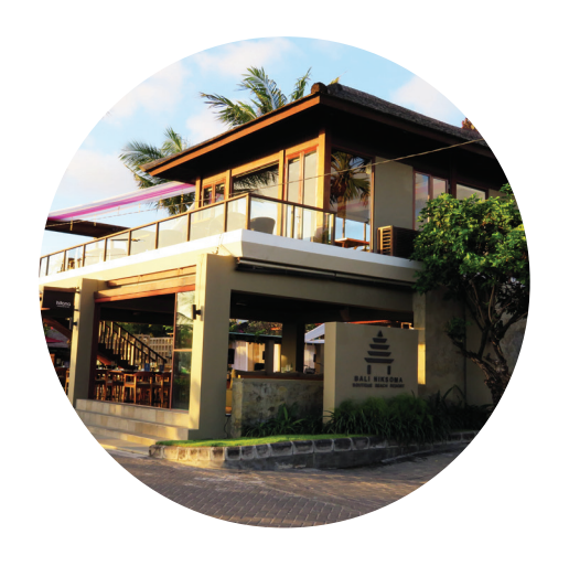
Conference Dinner Saturday 18<sup>th</sup> August The Bandha Hotel @ 7:00pm – late Poolside

Thursday 16<sup>th</sup> August Bali Niksoma @ 5:30 - 7:30pm Hitana upstairs